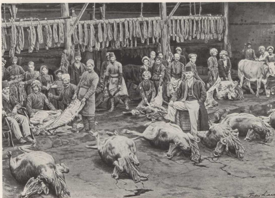
ARMENIANS PREPARING "BASTOURME," BEEF DRIED IN THE SUN, NEAR VAN