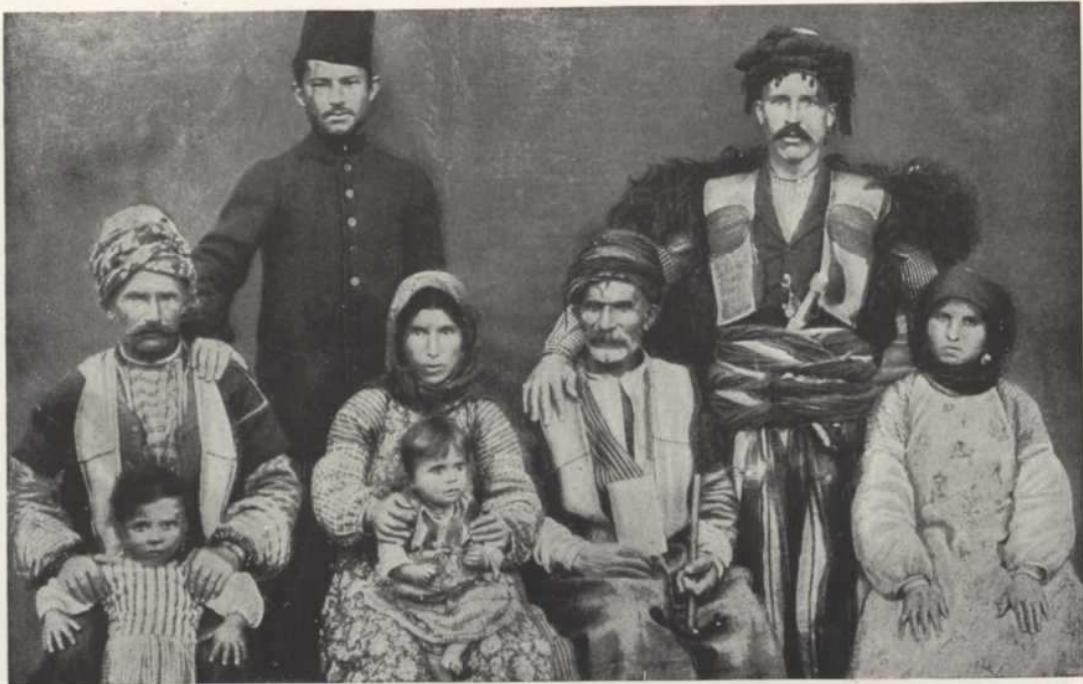
AN ARMENIAN FAMILY OF VAN

"Their appearance is definitely eastern; swarthy, heavy-haired, black-eyed, with aquiline features, they look more Oriental than Turk, Slav, or Greek. In general type they come closer to the Jews than to any other people, sharing with them the strongly marked features, prominent nose, and near-set eyes, as well as some gestures we think of as characteristically Jewish" (see text, page 334).