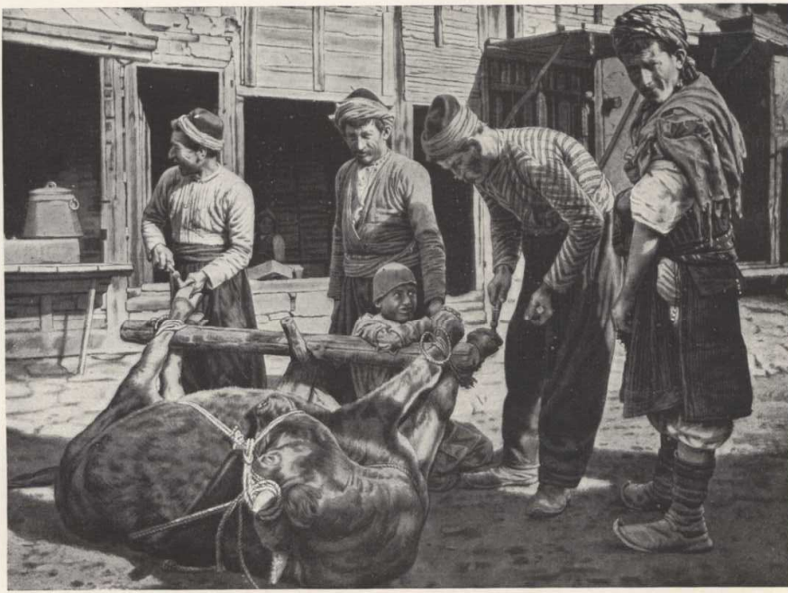
SHOEING AN OXEN ON THE VILLAGE MAIN STREET: VAN