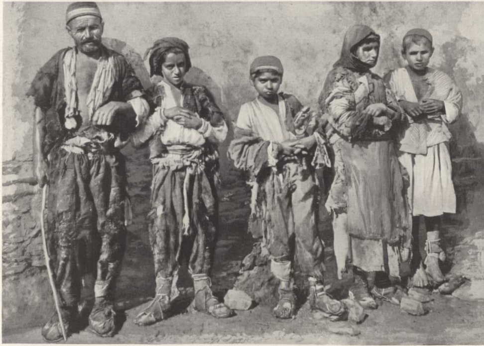
AN ELOQUENT PICTURE OF POVERTY IN ARMENIA