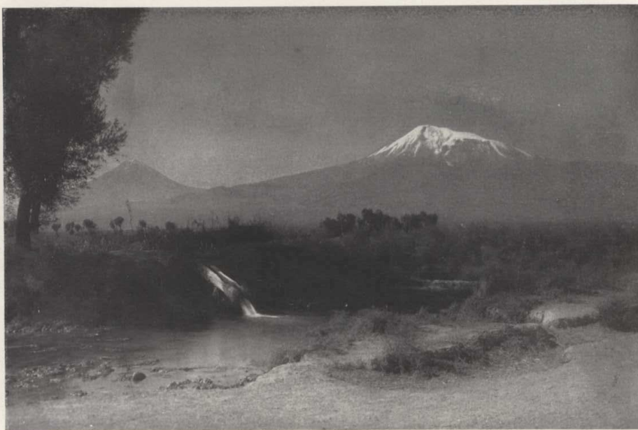
THE MOST FAMOUS OF MOUNTAINS, MOUNT ARARAT IN ARMENIA