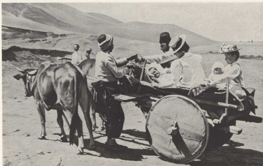
THE MOST COMMON VEHICLE IN ARMENIA

"Armenia is not easy to bound at any period of history, but, roughly, it is the tableland extending from the Caspian Sea nearly to the Mediterranean Sea. Its limits have become utterly fluid; the waves of conquering Persians and Byzantines, Arabs and Romans, Russians and Turks have flowed and ebbed on its shores until all lines are obliterated. Armenia now is not a State, not even a geographic unity, but merely a term for the region where the Armenians live" (see text, page 329; also map, page 359).